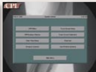
System Utilities Screen