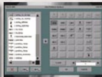
Auto Positioning Set up Screen