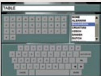
On-Screen Multi-Language Keyboard